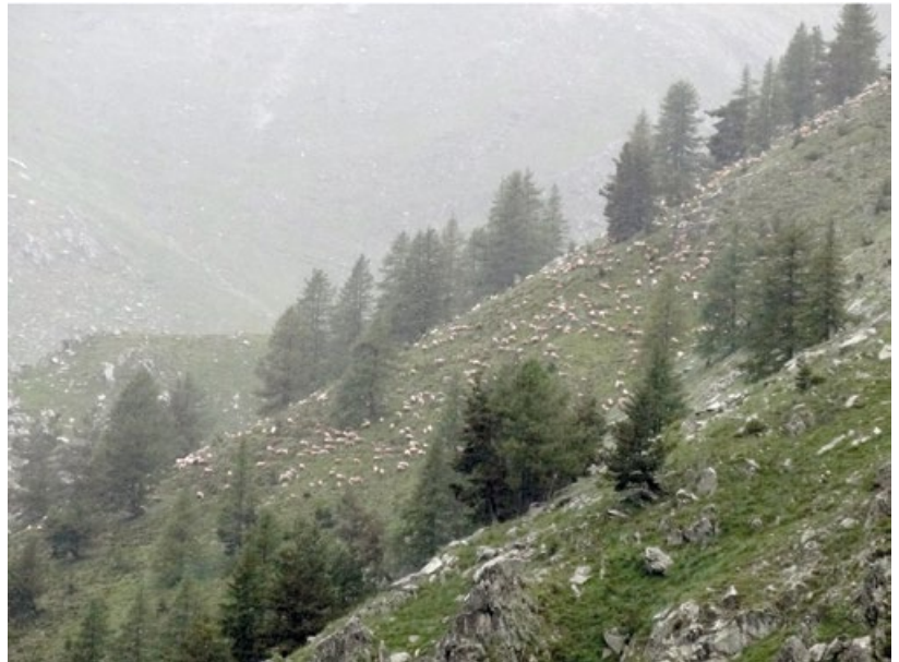
Fig. 5. During day-time, flocks scatter on large areas, which makes them difficult to protect.

MacNulty and colleagues (2009) demonstrated adult wolf predatory performance declines with age and that an increasing proportion of senescent individuals in the wolf population depresses the rate of prey offtake. Moreover, the performance weakening is correlated to the physical condition (Gurven et al.,