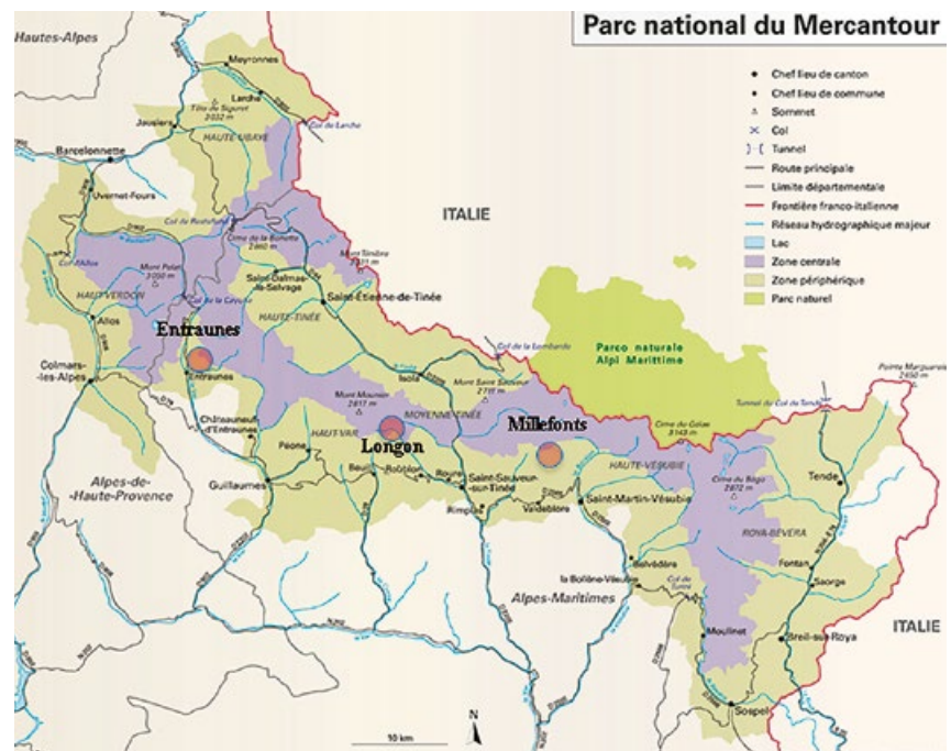
Fig. 1. Location of the three UP in the National Park of Mercantour (Maritime Alps).

We also fitted LGDs with GPS collars (I-gotU GT-120) during the night-time surveillance. Since wolf chasings by LGD last an average of 5 seconds to 2 minutes (Landry, 2013), we adjusted the GPS collars accordingly with a threshold speed of 10 km/hour. A point was recorded each 10 seconds (primary interval) under this speed limit (maximum displacement of 20 m) and each 2 seconds after that (secondary interval). The GPS autonomy was around 20 hours and so we fitted the dogs with the GPS collars every evening and removed them the next morning to charge the battery during the day.