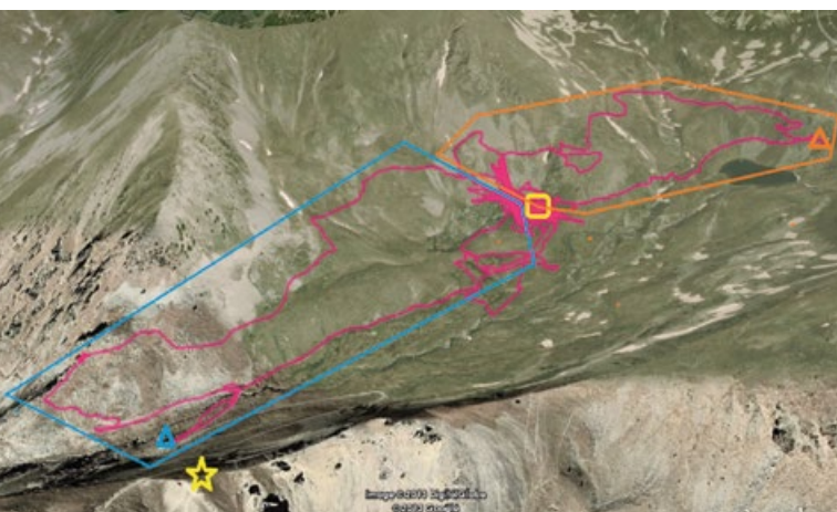
Fig. 3. Routes of one LGD chasing a wolf (pink lines). The blue polygon encloses a chase anti-clockwise initiated in the shepherd hut (yellow square), where the flock was bedded, ending at the blue triangle. The orange polygon encloses a second chase, clockwise from the shepherd hut, ending at the orange triangle.

a few hundred meters to more than one kilometre (Fig. 3). Prior to or during long chases ( n=3 ), the wolf being chased seemed to wait for the LGDs instead of running away. In one case, the wolf being chased stopped and watched the LGD running by, even though 2 minutes before it was confronted by it and displayed a fearful aggressive behaviour (with low posture, ears back, tail under the belly, mouth wide open) (Fig. 4).