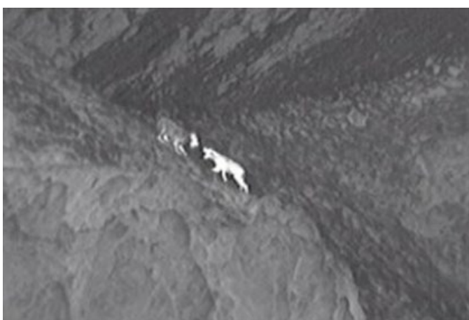
Fig. 4. A wolf (on the right of the image) facing a LGD (on the left).

In two separate events, a LGD did not chase away two wolves which were standing nearby. In the first occasion, one wolf approached the LGD and sniffed it (Table 1). In the other event, the LGD sniffed the ground and approached two wolves feeding on a sheep carcass. The wolves then approached the LGD and attacked. The LGD defended itself by chasing them away. After that the wolves returned to feed on the carcass, while the LGD retreated sniffing the ground. On two PUs, wolves and LGDs were seen in proximity of each other (less than 100 meters apart) near the shepherd's hut (less than 100 meters away), without interacting.